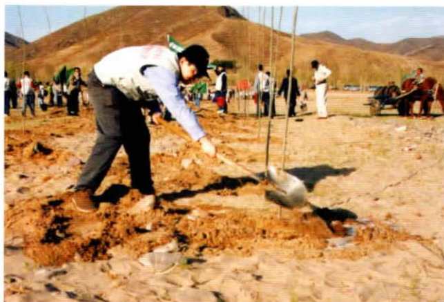
志愿者在荒山上植树 Volunteer are planting trees on barren mountains

近些年来，北京团市委、北京志愿者协会每年都会集中组织青少年或面向社会招募志愿者进行植树造林、沙漠治理、水污染整治、清除白色垃圾等环保志愿服务活动。据统计，截止到目前，参加绿化活动的青少年达600多万人次，共植树3000万棵，种草740万平方米，种花2100株，开辟回归纪念林、民族团结林、新婚纪念林、青年林等20多处。