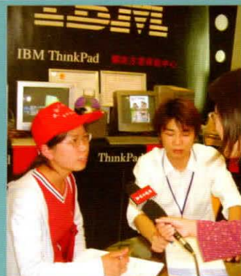
经济普查志愿者接受采访 Volunteers of the economic census are being interviewed