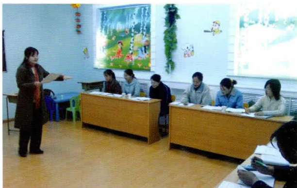
志愿者在培训打工子弟学校的英语教师 Volunteer training the english teacher from the schools for immigrant employees' children

In order to let the immigrant employees' children accept systematic and equivalent education as their peers, BVA started the project of voluntary service for “Love help children growth” in October 2005. On 19 th October, the project of voluntary service for “Love Help Children Growth”-English teacher training course for immigrant employees' children school starts to work in the Beijing Giant School, the English teachers come from seven schools for immigrant employees' children. received the training. The Project will develop the training courses including the immigrant employees' children's education psychology, traditional culture, civilized etiquette training, and in order to improve the teacher's quality of the school for immigrant employees' children. Meanwhile, it will help the immigrant employees' children school establishing their own youth league branch. Depending on the youth league branch, they can develop plentiful and colorful extracurricular activities, and jointly help the immigrant employees' children grow healthily.