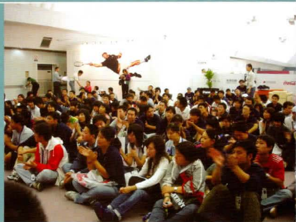
第二届中国网球公开赛志愿者培训 Volunteers are receiving training in the second China Open