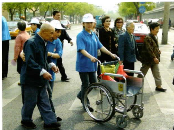
志愿者在天坛服务 Volunteers are providing service in Heaven of Temple

During the May Day holiday in 2005, in order to actively cooperate with the China Communist Youth League Beijing Committee to carry out the Smiling Youth Activity, BVA organized 50 plus volunteers to participate in a signing activity named “My promise on the civilized etiquette” at the Temple of Heaven Park, popularized knowledge to the vast number of citizens about civilized etiquette and preparation for the Olympics. Accompanied by Guan Chenghua, secretary of China Communist Youth League Beijing Committee, Qiang Wei, deputy secretary of Beijing Municipal Committee, went to the Temple of Heaven Park personally to visit the volunteers who are providing services passionately .