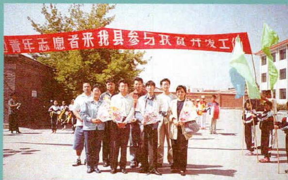
2000年，第三批扶贫接力志愿者赴内蒙古服务 In 2000, the third batch of poverty alleviation relay volunteers went to Inner Mongolia to provide services