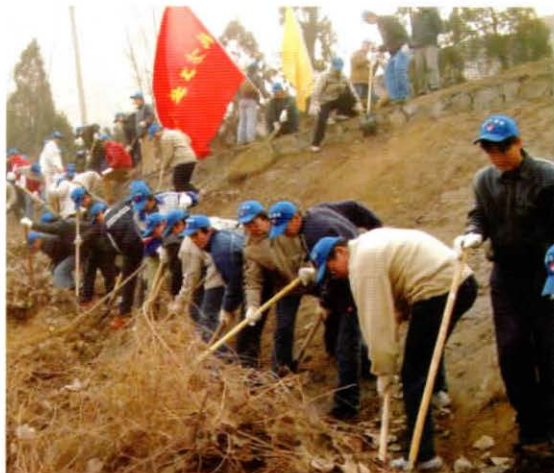
志愿者清理排洪渠 Volunteers are clearing up the flood relief channel