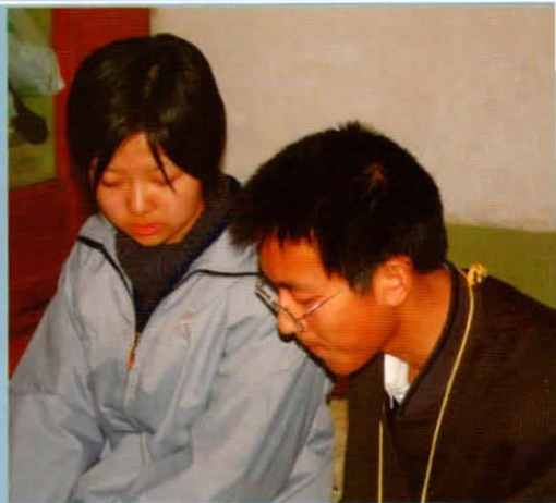
志愿者为社区贫困居民子女提供义务家教服务 A volunteer is providing free family tutoring to a schoolgirl from a poor household