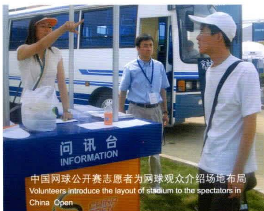
中国网球公开赛志愿者为网球观众介绍场地布局 Volunteers introduce the layout of stadium to the spectators in China Open