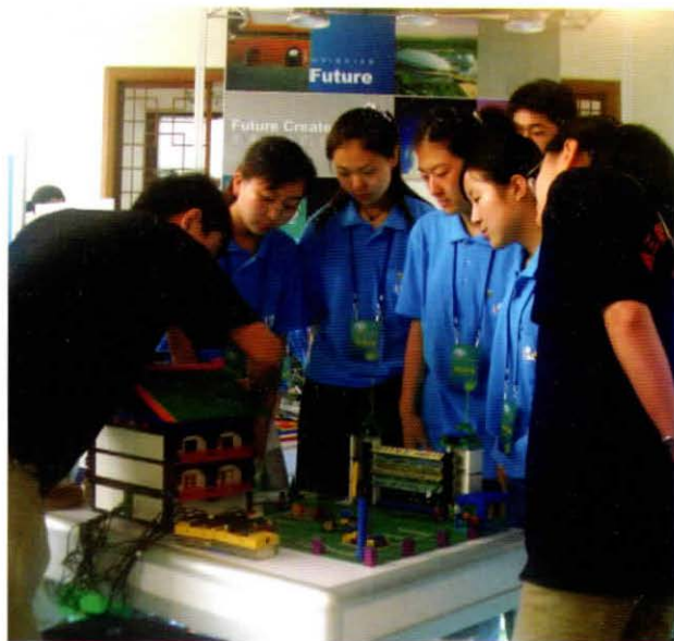
APEC志愿者帮助工作人员安装科学发明设施 Volunteers of APEC help staffs to install the scientific invention device