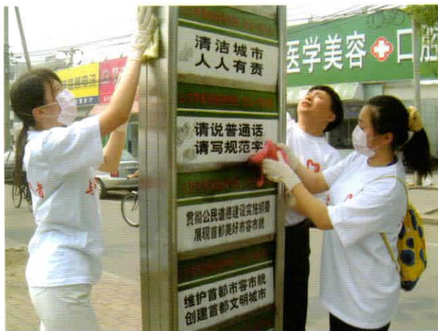
志愿者在北京街头清洗公交站牌 Volunteers are cleaning up the bus boards in the street Beijing