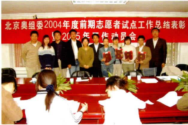
北京奥组委2004年度志愿者工作表彰总结会 Conclusion and commending conference of volunteer work of BOCOG in 2004