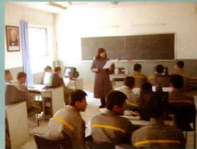
志愿者为少年犯授课 The Volunteer are teaching the juvenile delinquent