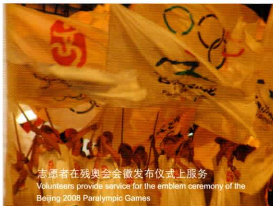
志愿者在残奥会会徽发布仪式上服务 Volunteers provide service for the emblem ceremony of the Beijing 2008 Paralympic Games