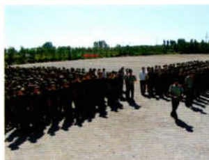
第三届基层服务团志愿者军训 Military training of volunteers of 3 rd Capital Graduates Grass-root Level