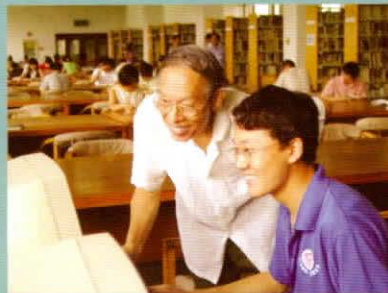
图书馆项目志愿者为读者服务 Volunteers of library program are providing service for the readers