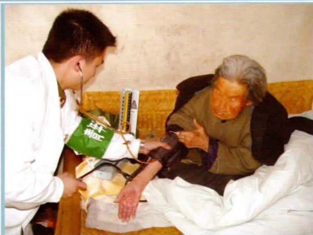
志愿者在社区中开展义诊活动 Volunteers are providing free medical service in the community