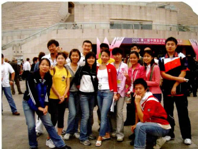
参加第二届北京国际美术双年展志愿者合影 Volunteers have a group photo on the Second Beijing International Art Biennale