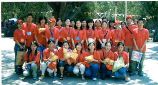
“六一”儿童节志愿者合影 Volunteers have a group photo on International Children's Day

自1996年以来，按照市人大常委会《关于在十六周岁至十八周岁未成年人中开展成人教育的决议》的规定，组织全市16—18周岁的中学生在成人宣誓前，参加48小时的绿化环保、帮助弱势群体等志愿服务活动，使他们在实践中增强对国家、对社会、对家庭、对他人的责任感。这项活动已经在北京市各中学广泛开展起来，其中重点城区实现了100%参与率。成人预备期志愿服务寓教育于服务之中，成为教育中学生的有效载体。