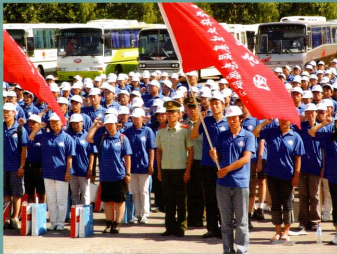
第二届基层服务团出征仪式 Expedition ceremony of the third Capital Graduates Grass-root Level