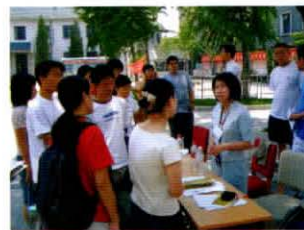
大学生踊跃报名加入基层志愿服务团 Students sign up enthusiastically to join the project of Capital Graduates Grass-root Level