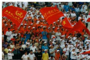
大学生运动会彩虹志愿者 The rainbow volunteer of the 21 st universiade

Since the founding, the Association adheres to the concept of "dedication, fraternity, mutual-aid and progress", conduct