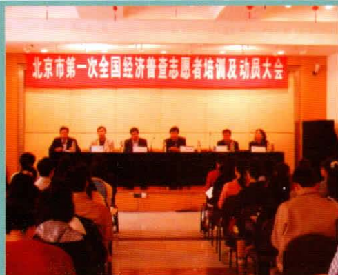
北京第一次全国经济普查志愿者在人民大学接受培训 Volunteers of the first National Economic Census are being trained in Renmin University of China.