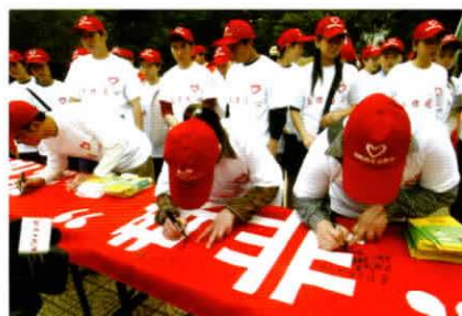
非典志愿者踊跃签名以表抗击非典的决心 SARS volunteers sign their names enthusiastically to show the determination of fighting with SARS