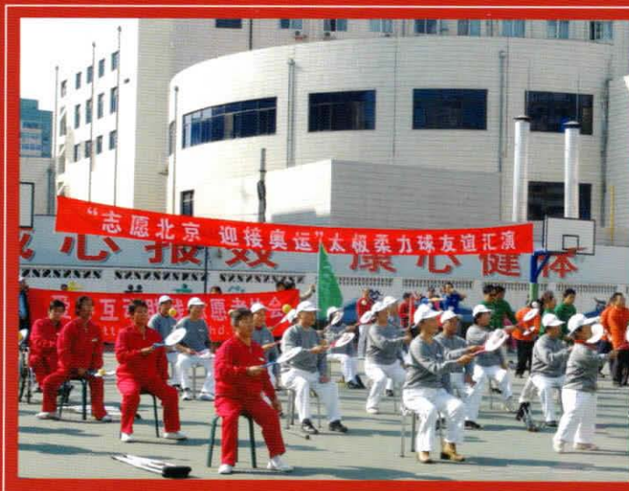
太极柔力球爱好者同场献技 Taiji softball fans participated in the show