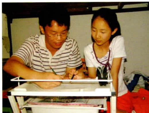
首经贸志愿者帮助烈士后代辅导功课 A volunteer from Capital University of Economics and Business is helping children study

“爱心助成长”志愿服务计划将逐步开展打工子弟教育心理学、传统文化、文明礼仪等方面的培训，全面提高打工子弟学校教师的素质；同时将帮助打工子弟学校建立自己的团支部，依托团支部，开展丰富多彩的课外活动，共同帮助打工子弟孩子健康成长。