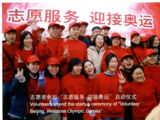
志愿者参加“志愿服务 迎接奥运”启动仪式 Volunteers attend the startup ceremony of "Volunteer Service, Welcome Olympic Games"