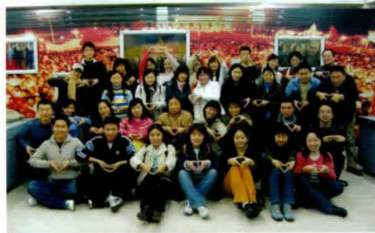
奥组委前期志愿者招募培训 BOOC on the pre-stage volunteer in training

2004年3月，北京奥组委人事部、北京团市委、北京志愿者协会启动了北京奥组委前期志愿者试点招募工作。截至2005年11月，该项目通过组织招募为主、社会招募为辅的方式，从踊跃报名的社会各界志愿者中，共招募了6批109名志愿者全职或兼职地为奥组委10余个部门提供志愿服务。目前，有44名志愿者正在为奥组委的筹备工作进行服务。