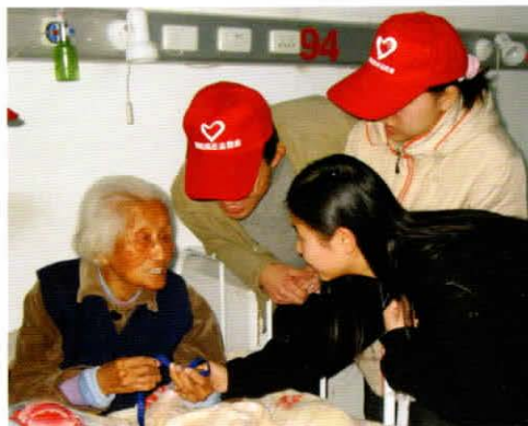
志愿者与老人亲切交谈 Volunteers are talking with the old man intimately

From 1997, the BVA and Beijing Committee of China Communist Youth League Beijing Committee organize university students to return to hometown during winter and summer vacations to provide voluntary service to the poverty-stricken and remote areas, where economy and education are backward. The student volunteers participate in activities including conducting theory propaganda, supporting agriculture with science and technology, joint building of community, enterprise management, medical care service, environmental protection, and education support and illiteracy elimination, etc.. During this process, they not only contributed to the development of the motherland, but also learnt and improved a lot. Every year, over 100,000 students in the Capital participate in the social practice of voluntary service activities annually. More and more students are involved in the project year by year. Moreover, over 100 voluntary service teams are organized to conduct the Actions of Contribution to the Capital, with a focus on the modernization of the capital, providing voluntary services, such as community joint building, service for the outskirts of Beijing, environmental protection, and so on.