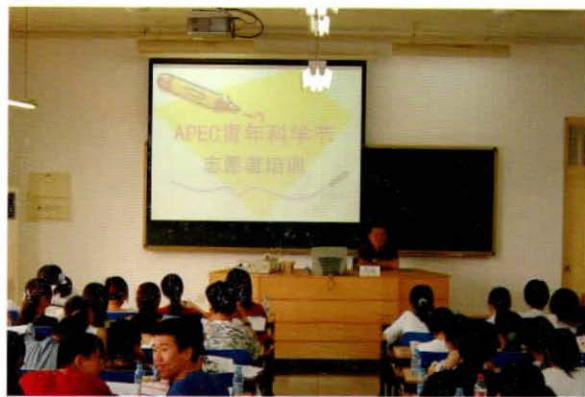
APEC青年科学节志愿者培训 Volunteers of the 3rd APEC Youth Science Festival in training

2004年8月3日—9日，第三届APEC青年科学节在京隆重举行。根据活动需要，北京志愿者协会配合组委会共招募志愿者620名，其中教师志愿者120名，大学生志愿者500名。按个人专长及工作性质的不同，分别承担了代表团迎送、组委会联络、代表团组织活动以及科技展览工作。经过统一的招募、培训，志愿者们积极投身第三届APEC青年科学节志愿服务工作。活动期间，广大志愿者认真负责、谦逊细致、专业到位的服务得到了亚太经合组织成员代表、出席活动的国内外青少年以及参观人员的广泛好评。