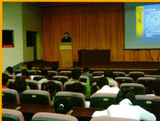
奥运志愿服务宣讲团在宣讲 Beijing 2008 Olympic Games voluntary service propaganda group is preaching