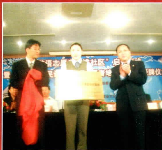
“北京市民讲外语”揭牌仪式 The ceremony of unveiling the tablet of “Citizen of Beijing Speak English”