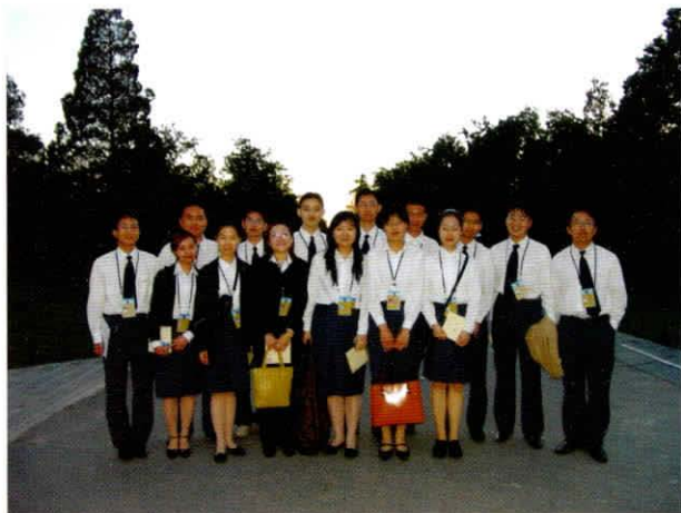
2005年财富全球论坛志愿者合影 Volunteers have a group photo on 2005 Fortune Global Forum