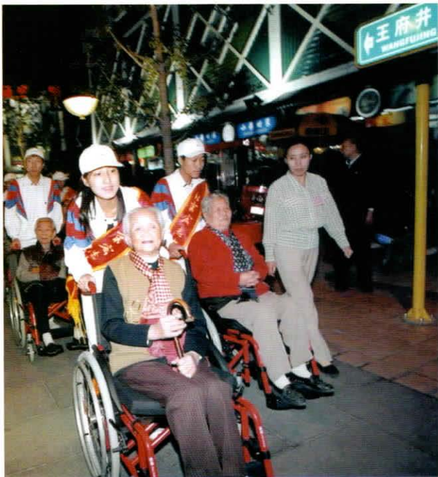
中学志愿者陪孤寡老人逛王府井 Volunteers from middle schools are accompanying with the bereaved elders to visit Wang Fujing Street

From 1996, the BVA has organized middle school students of the whole city aged between 16 and 18 to participate in 48-hour voluntary service activities on greening and environmental protection and provide help to those disadvantaged before their oath-taking ceremony for newly grow-ups. The purpose is to build up their sense of responsibility to the country, society, family and others. This activity has been widely conducted in all middle schools of Beijing. In the key downtown areas, participation rate has reached 100%. The project has become an efficient platform for middle school education because students are educated through service provision.