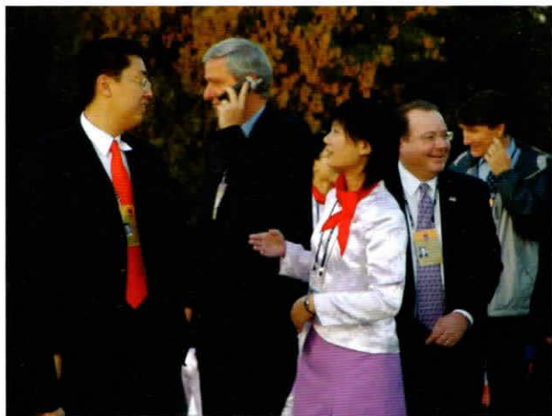
财富论坛志愿者在服务 Volunteers of Fortune Global Forum are providing service

2005年3月，共青团北京市委联合北京志愿者协会按照北京《财富》论坛组委会的指示，在清华大学、北京师范大学、北京外国语大学、中国传媒大学、对外经贸大学招募了228名志愿者提供为期近十天的志愿服务工作。志愿者们经过一系列的志愿服务理论知识培训和实战演练，被分配到论坛的内宾接待组、外宾接待组、宣传组和会务组。提供文档管理，信息处理，内宾联络，外语翻译，新闻旅行团、配偶旅行团的陪同，论坛宴会、酒会服务等专项志愿服务。志愿者的突出表现受到了各方用人单位的好评。