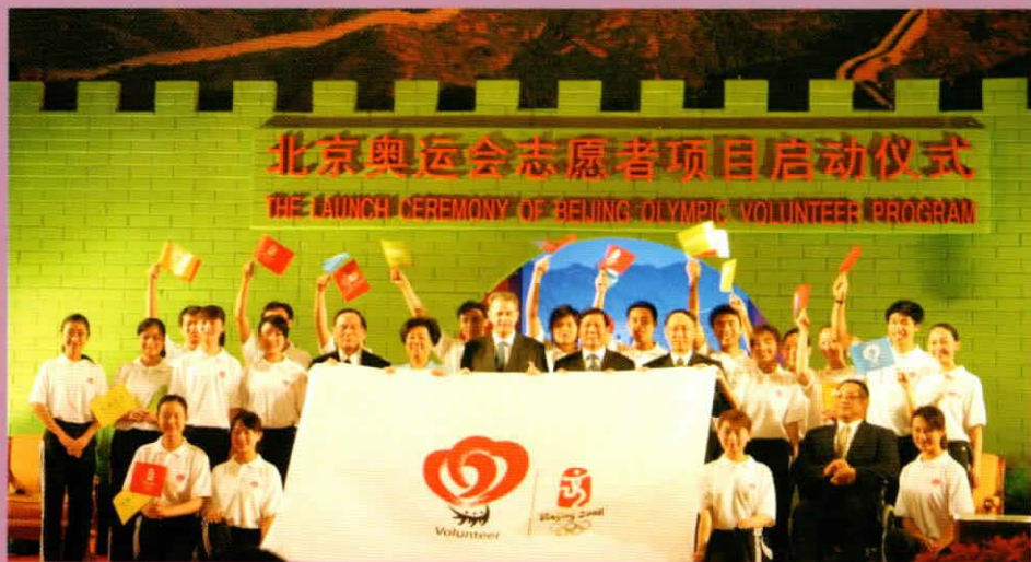
北京奥运会志愿者项目启动仪式 Startup ceremony of volunteer project of Beijing Olympic Games