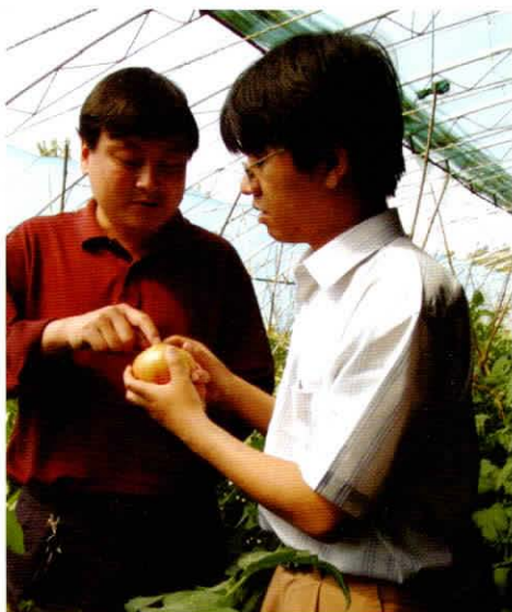
大学生志愿者用科技知识帮助村民提高农业生产 Volunteer helps villagers to improve their agricultural production by using their science and technology knowledge