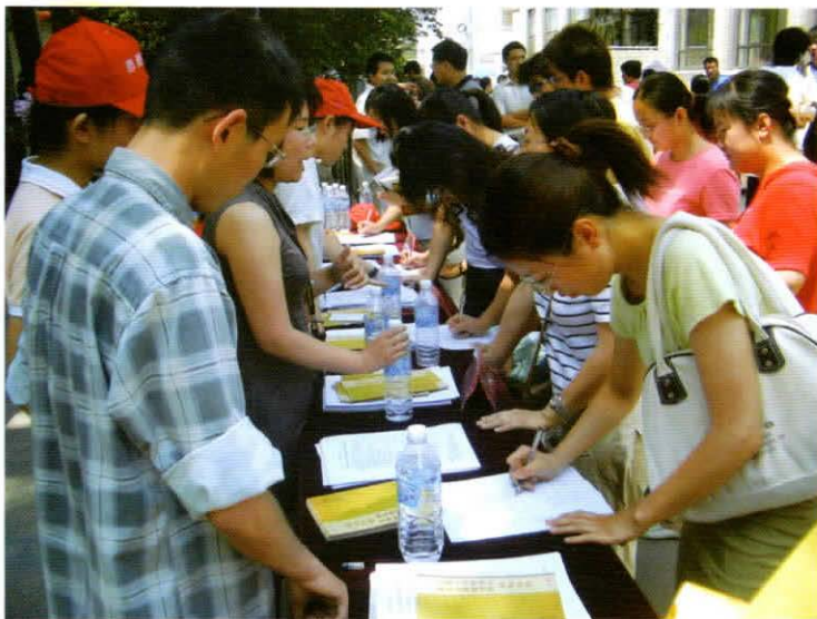
志愿者现场注册报名 Students are registering to be volunteers