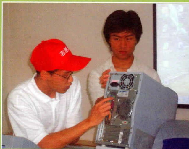
数字志愿者向学员介绍计算机构造 Digital volunteers are introducing the structure of computer to the students