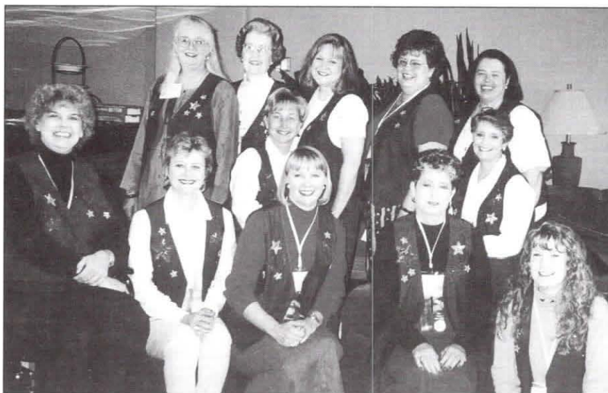
1998 Conference Planning Committee - Texas