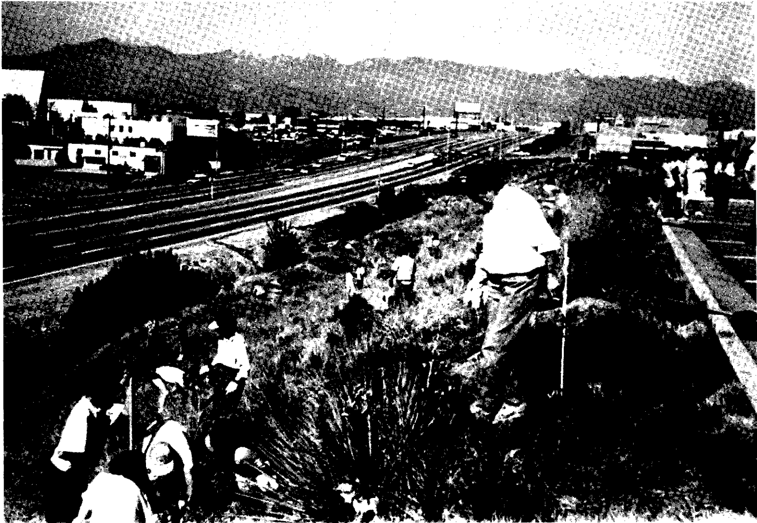
Colorado Springs annual beautification event - Green Springs, May 1989 (Region XII)