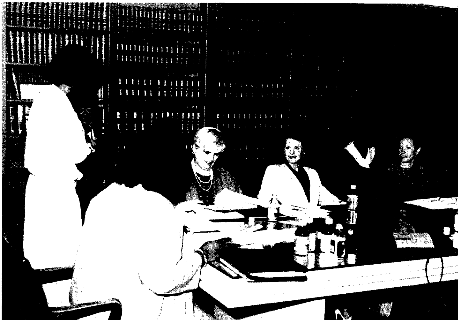
Alabama leaders planning 5th annual Governor's Conference on Volunteerism and 3rd annual AVA Region V mini-conference (Region V)