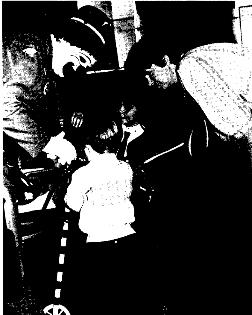
A volunteer at work from the New Hampshire Governor's Office on Volunteerism (Region I)