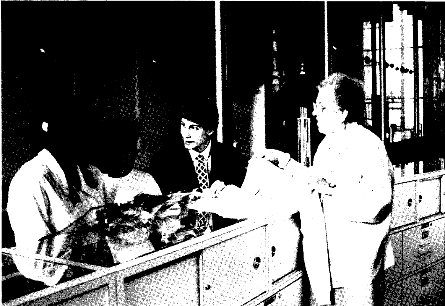
Friends of the Kennedy Center volunteers provide free tours of the Kennedy Center to 155,000 visitors each year, Washington, DC (Region III)