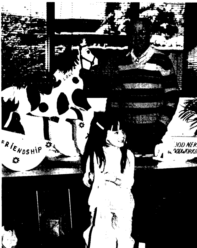
Reston Good Neighbors Woodworking Project sponsored by Fairfax Area Agency on Aging and Reston Community Center, VA (Region IV)