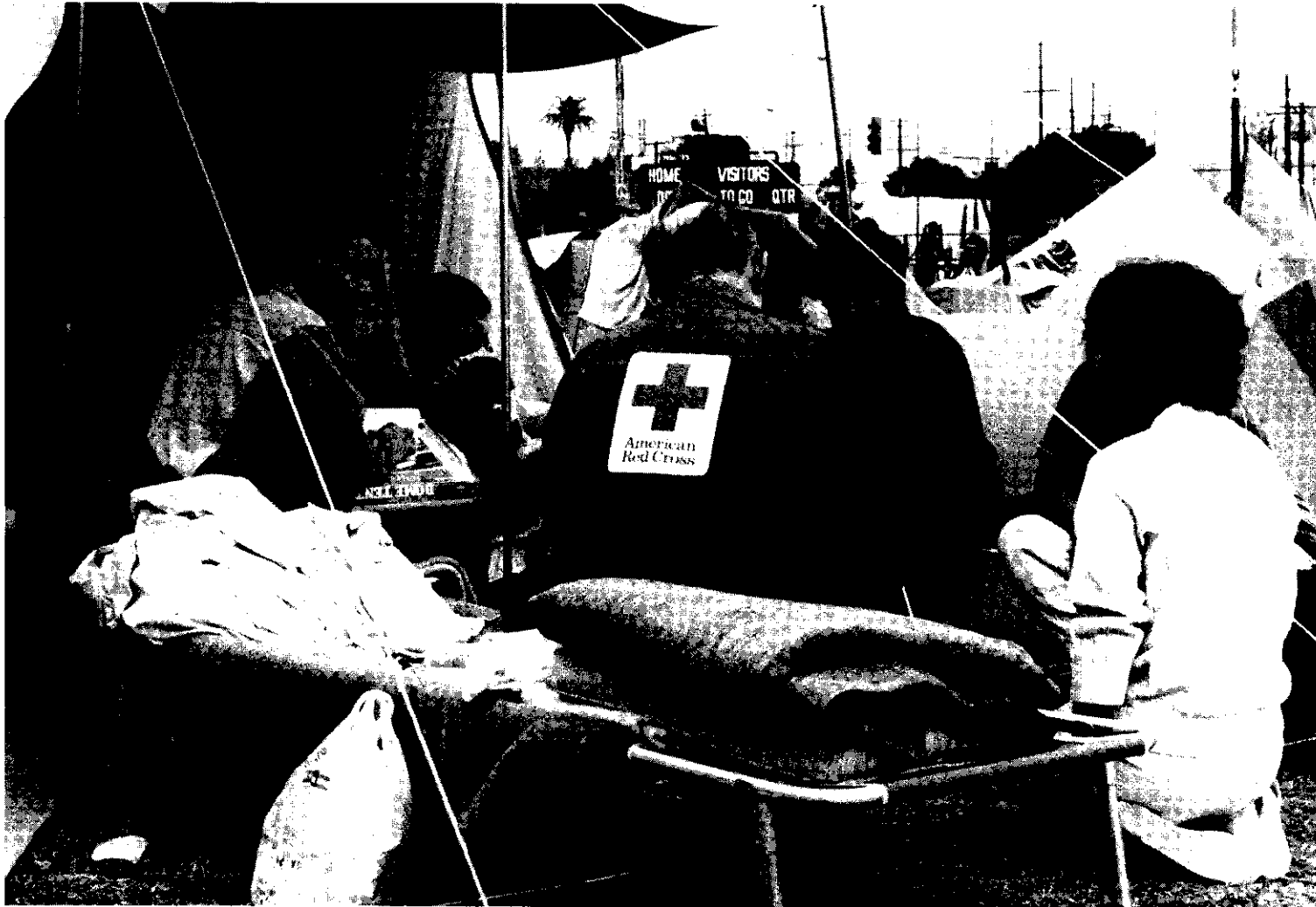
The American Red Cross responding to the Whittier earthquake, 1987 (Region XI)