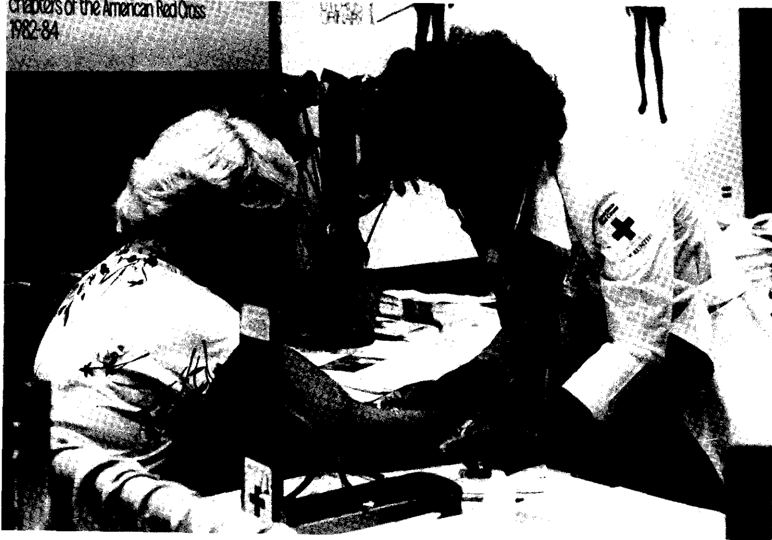
Blood pressure screenings being done by an American Red Cross volunteer at a health fair (Region XI)

creators of the American Red Cross 1982-84