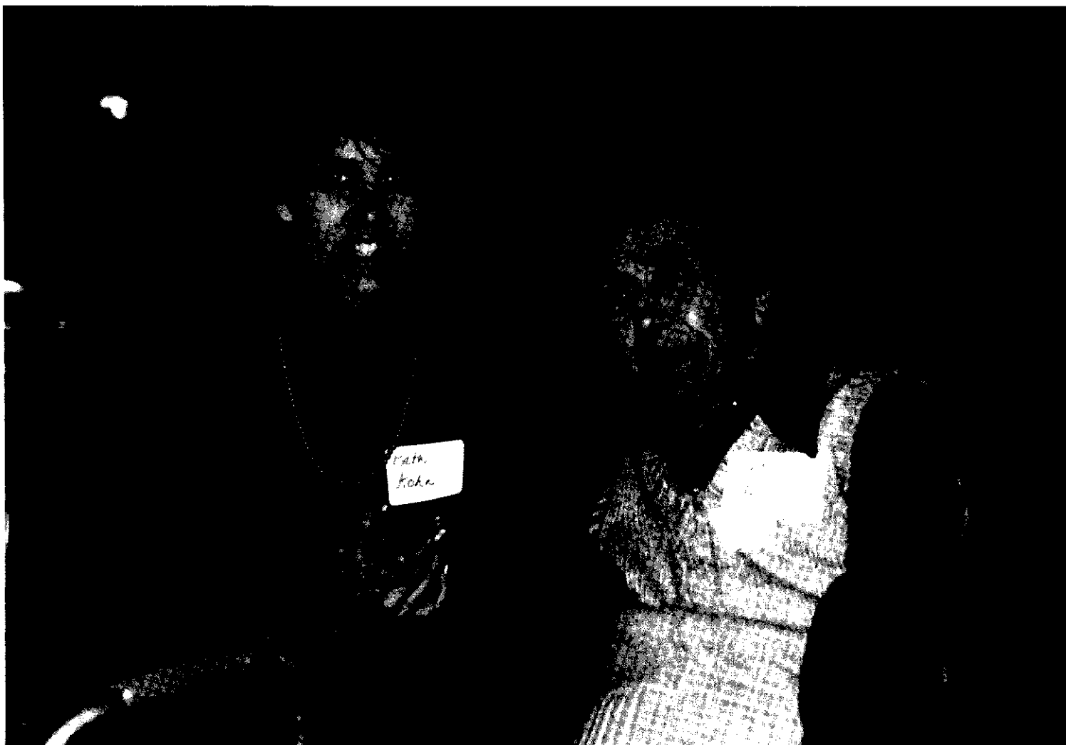
Friendly Visitor program through Jewish Family Service, Dallas, Texas (Region VI)