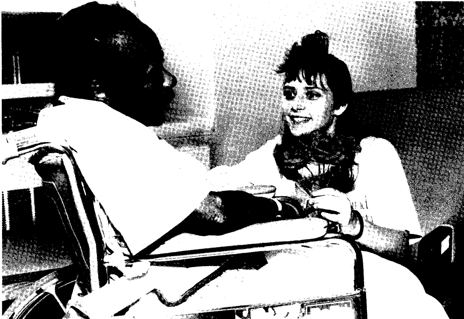
A Friendly Visitor from the Maryland Student Alliance at the Francis Scott Key Medical Center, MD (Region III)