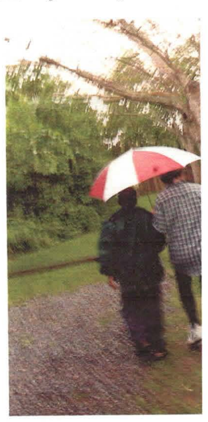
... and go for walks in the great outdoors.

She and I finally came to verbal blows not the Apollo spacecraft. We were waiting to se IMAX movie on the space program, and grandmother, who had filled in for another ent at the last minute and had been insisting we return to New York since before we had rived, was again demanding that we leave im